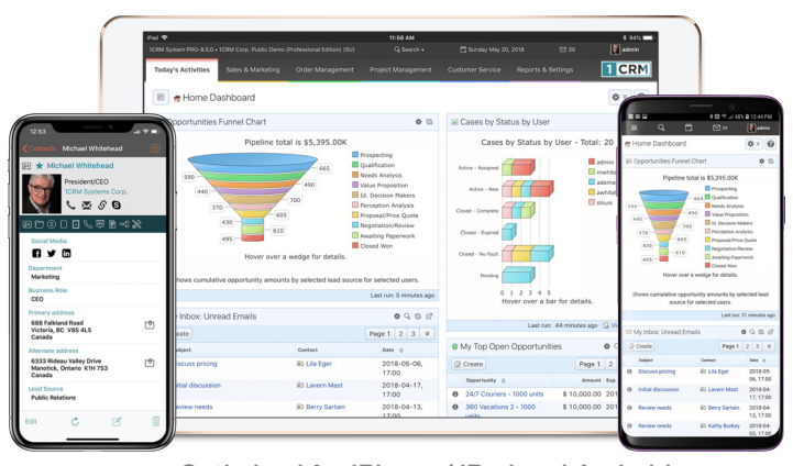
Optimized for iPhone / iPad and Android