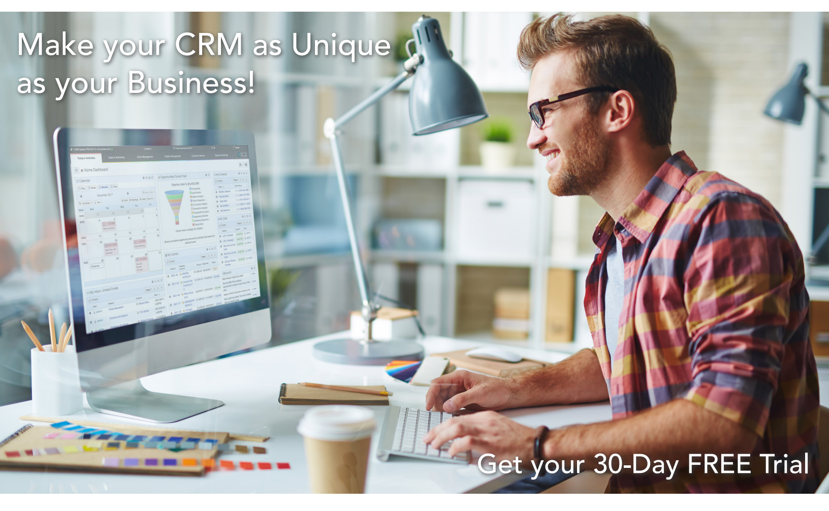
Get 1CRM - The most customizable, complete, and cost-effective CRM on the market.